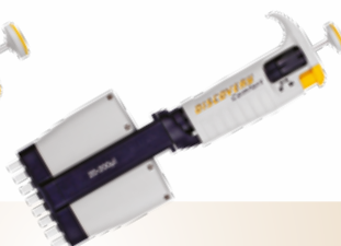
DV8 – 8 channels