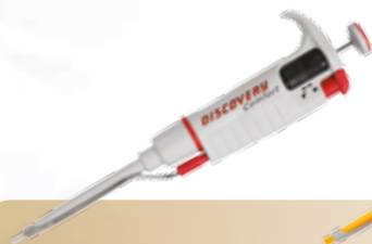
DV – grey shaft