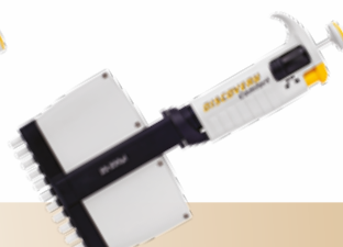
DV12 – 12 channels