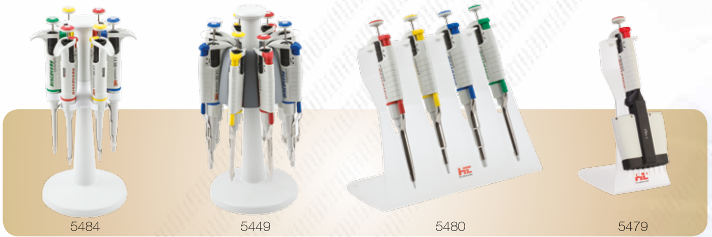
5484 Carousel stand