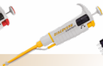
D – colour shaft